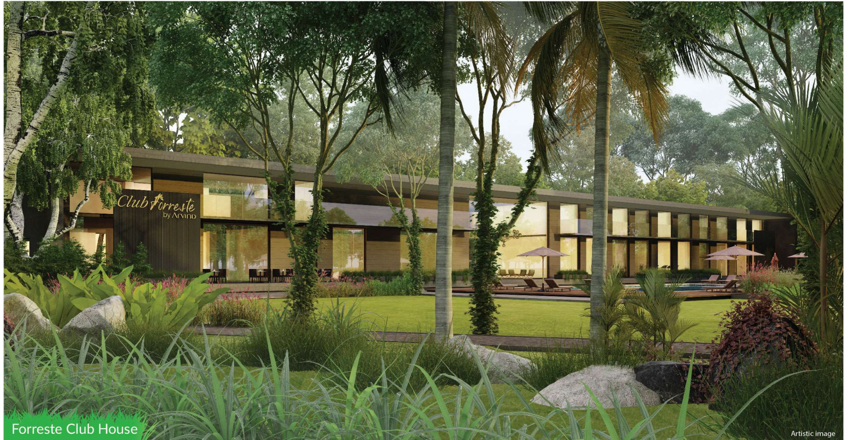
Forreste Club House

The clubhouse at Forreste is a complete experience in itself. Family activities or solo relaxation, this centerpiece of life at Forreste has been designed to suit all your needs.