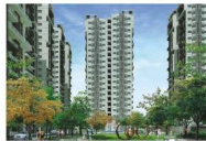
APARNA SAROVAR GRANDE (Work in progress) 720 Luxury Lifestyle Apartments, Nallagandla