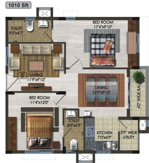
2 BHK - East Facing - 1010 Sft