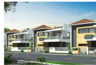
APARNA HILLPARK GARDENIA (Work in progress) 116 Premium Luxury Villas, Miyapur, Chandanagar