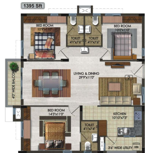
3 BHK - East Facing - 1395 Sft