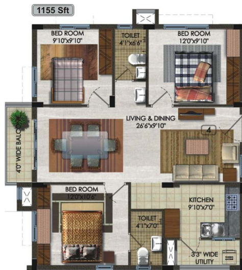
3 BHK - East Facing - 1155 Sft