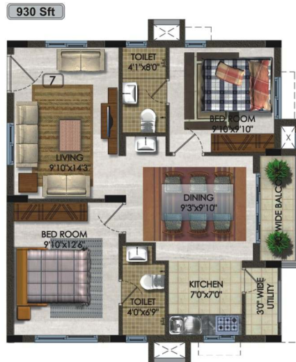
2 BHK - West Facing - 930 Sft