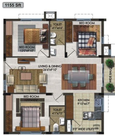
3 BHK - West Facing - 1155 Sft