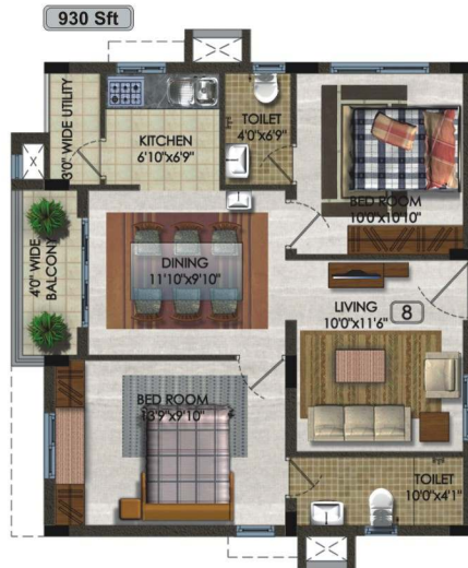
2 BHK - East Facing - 930 Sft