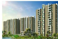
APARNA HILLPARK LAKEBREEZE (Work in progress) 943 Lovesties, Miyapur, Chandanagar